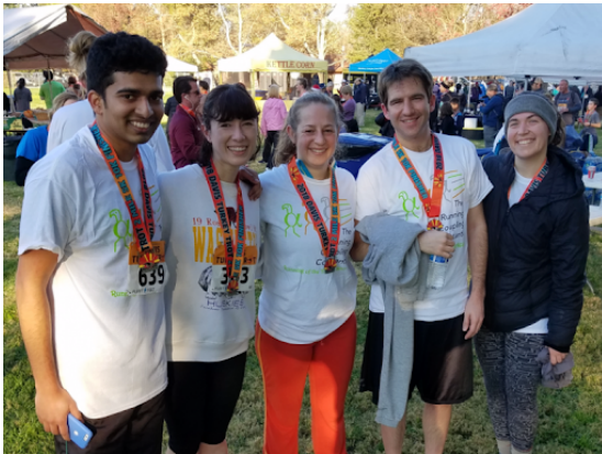
UC Davis Physics Grad Students