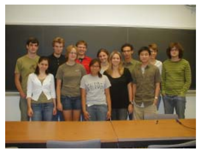
REU Research Group 2007

With over 200 applicants, admission is extremely competitive. Most REU students do excellent work, and every year several coauthor publications from their brief time at Davis. Last year's projects included simulating how robots can `learn' new behaviors, analyzing