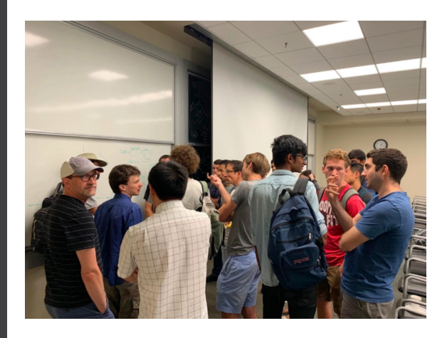
This coffee break photo shows the level of intellectual excitement at the QI-QG conference. The participants have foregone refreshments in order to gather around a white board for intense discussion.