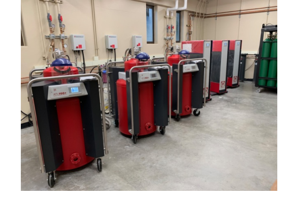
The new Helium laboratory in the basement of the Physics Building

The university's substantial investments in physics recognize our potential for further achievements, in part because our department culture is collegial, adventurous, and ambitious.