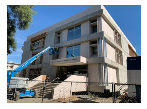
Renovations under way for the Center for Quantum Mathematics and Physics in the former Physical Sciences and Engineering Library.

Not surprisingly, with growth comes construction. The Physical Sciences and Engineering library building has been redesigned to house the Center for Quantum Mathematics and Physics (QMAP), a joint endeavor of the Math and Physics departments. QMAP faculty, grad students, postdocs and visitors will be located together in the new space, which will feature plenty of places for spontaneous interactions and connections. Construction is well underway, with move-in slated for summer 2020.